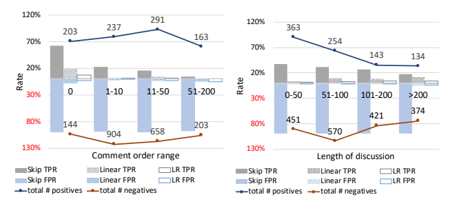
(a) TPR/FPR against time order (b) TPR/FPR against discussion of a comment. length (# comments).

To supplement this result, we analyze the true and false positive rates of the models against discussion dynamics. Figure 2 shows that linear and skip-chain CRFs identify more true positives than logistic regression for longer discussions and for plausible comments that come later in a discussion.